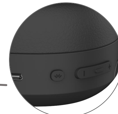
Silicone physical buttons