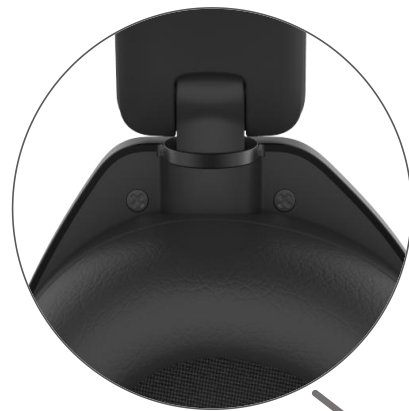
Upgraded pivot hinge for fully foldable design