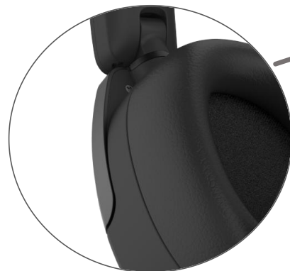
Skin-friendly imitation protein leather