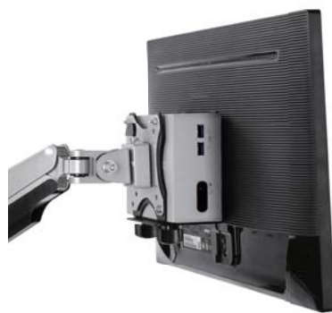
With VESA plate