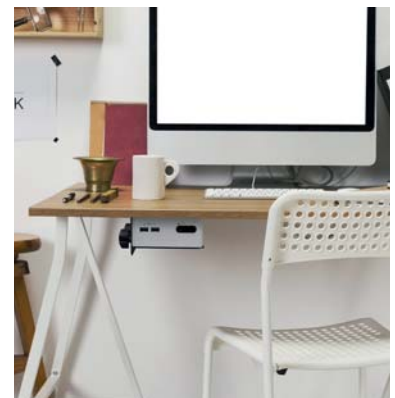
Can be fixed under desk